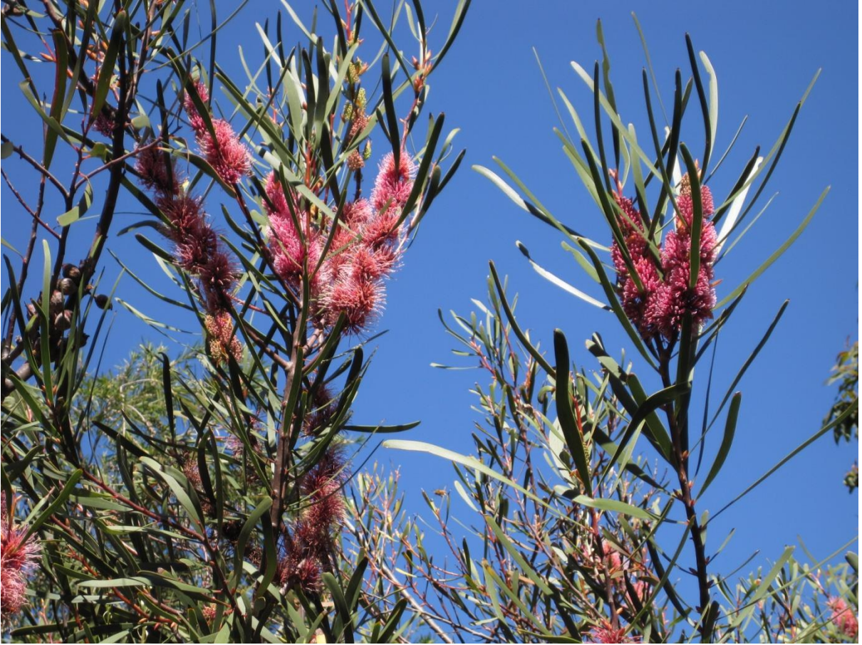
Hakea multilineata – a small midwinter flowering WA tree in the Editor's garden