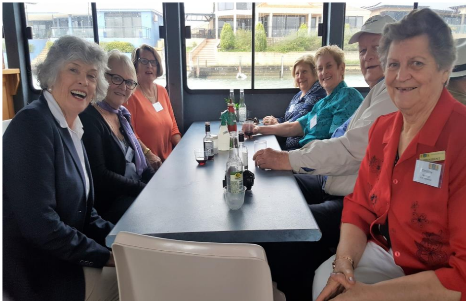
Interstate visitors (with some local U3A members)