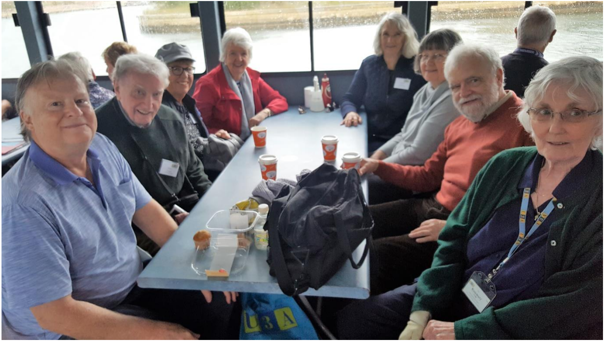
Another group from North Coast U3A and Mandurah U3A