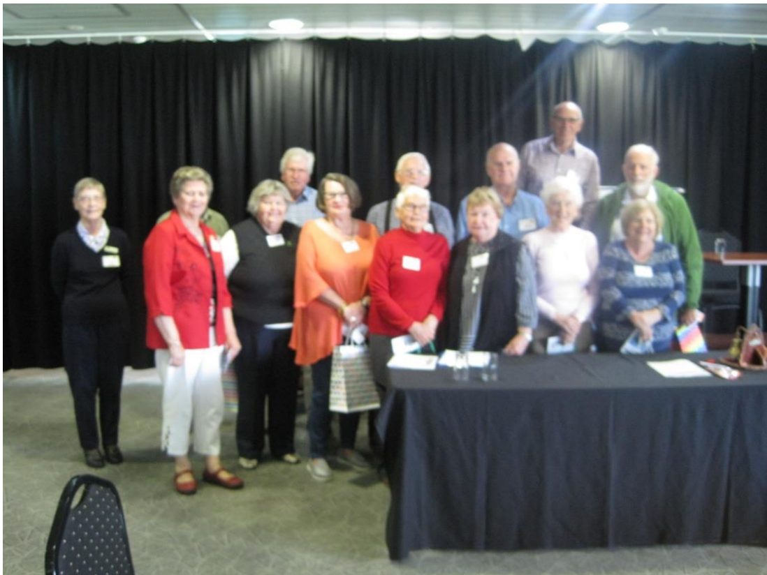
The Mandurah U3A volunteers who worked so hard to make things run smoothly.